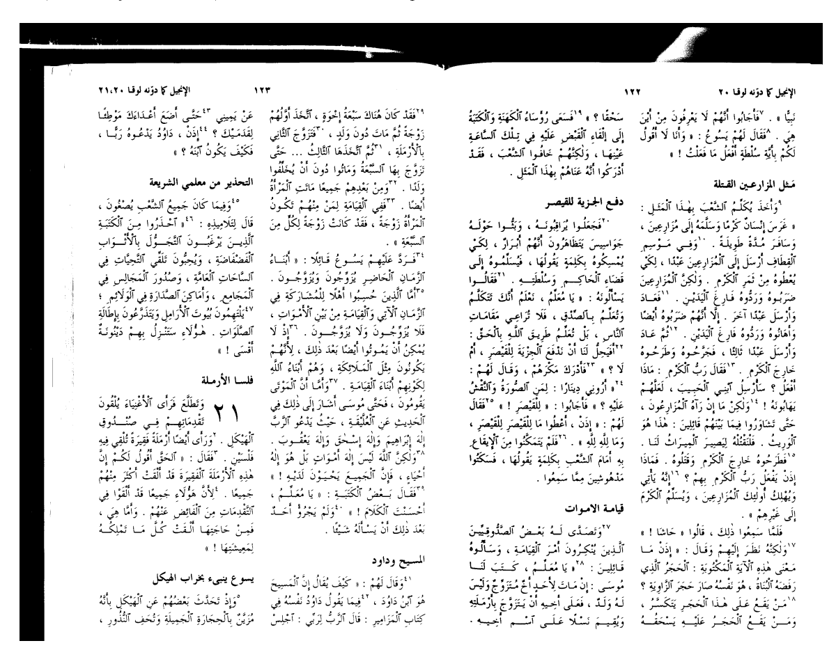
Figure 1. Scanned image of an Arabic Bible page.

In Figure 1 we show a binary scanned image from the Arabic Bible. Manually delineated zones for this image are shown in Figure 2. The zones are non-overlapping rectangles and are ordered in Arabic reading order. A section of the zone groundtruth file storing the attributes of a zone is shown in Figure 3. The details of the database design, file formats, directory structures, etc. is available in a separate article.<sup>1</sup>