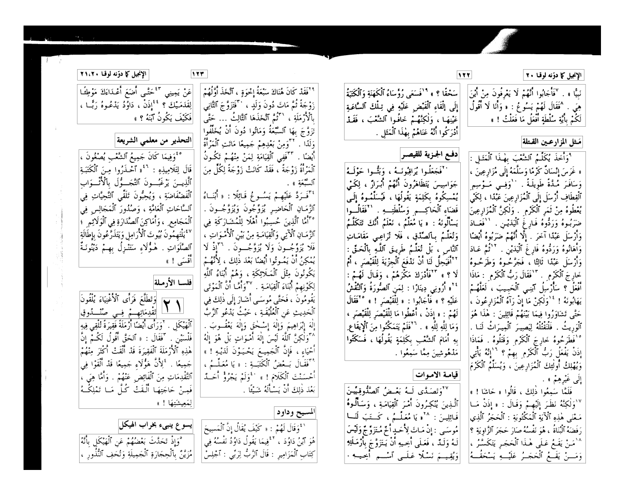
Figure 2. Zone groundtruth for the scanned image shown in Figure 1. Notice that the zones are rectangles and non-overlapping. The zones were created using the PinkPanther groundtruthing tool.<sup>7,8</sup>

foreground and background 4-neighbor distance of pixels is computed using a distance transform algorithm (see Borgefors<sup>21</sup>). The parameters \alpha_0 and \alpha control the probability of a foreground pixel switching to a background pixel and \beta_0 and \beta control the probability of a background pixel switching to a foreground pixel. The parameter \eta is the constant probability of flipping for all pixels. Finally, the last parameter k, which is the size of the disk used in the morphological closing operation, accounts for the correlation introduced by the point-spread function of the optical system. These parameters are used to degrade an ideal binary image as follows.